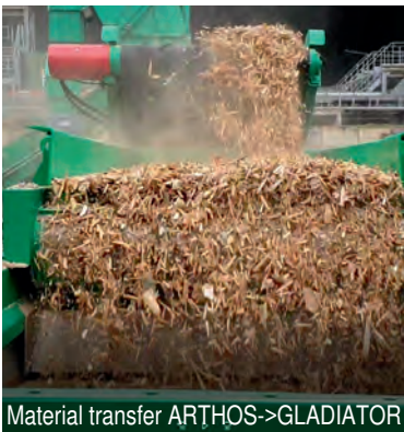
Material transfer ARTHOS->GLADIATOR

During the shredding demonstrations of the PVC plastic window profiles, the GLADIATOR ensured a clean separation of PVC from ferrous and non-ferrous metals (see pictures on the right).