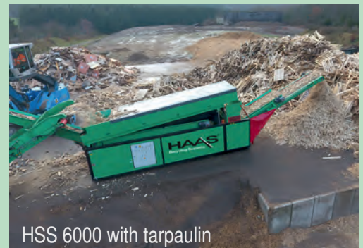
HSS 6000 with tarpaulin

Thanks to user friendly transport dimensions and low set-up times, the mobile system with hook lift is ready for the use anywhere at any time.