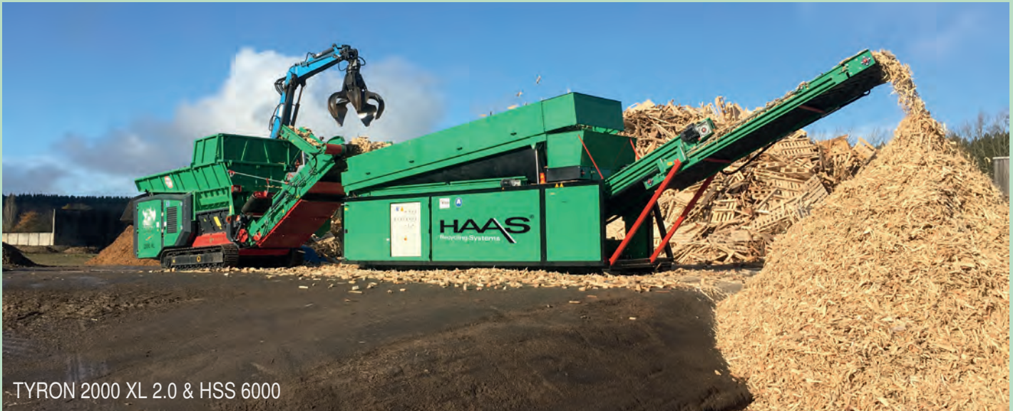
TYRON 2000 XL 2.0 & HSS 6000

The screening machine HSS 6000 with two fractions is the optimal complement to our TYRON and is part of our HAAS product range since 2018. The screening machine with an enormous achievement for a large range of applications has been introduced to the international sales network and could be tested extensively.